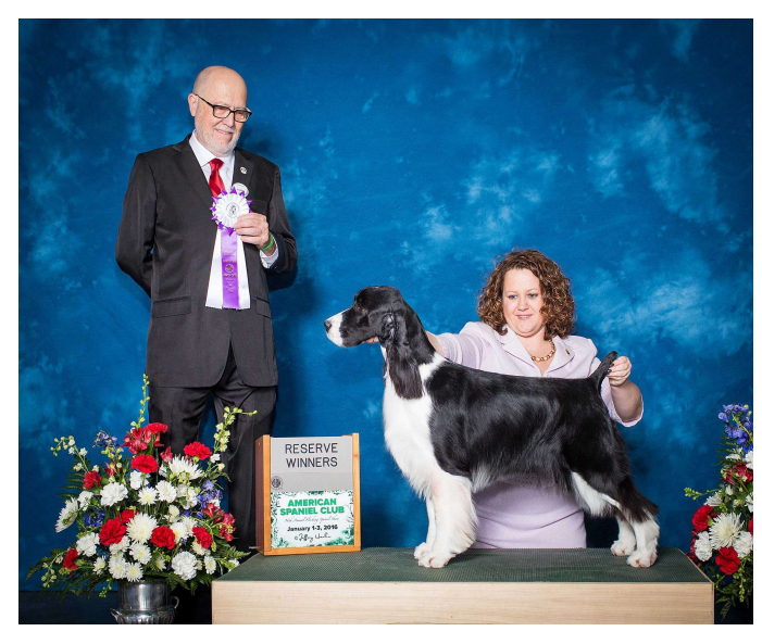
Willa Derby'N'Oxford's Lady of Sonnets RWB at 2016 Spaniel Club