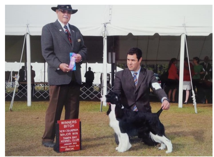
Marlow Derby'N'Oxford's Glamour Girl completing her CH title